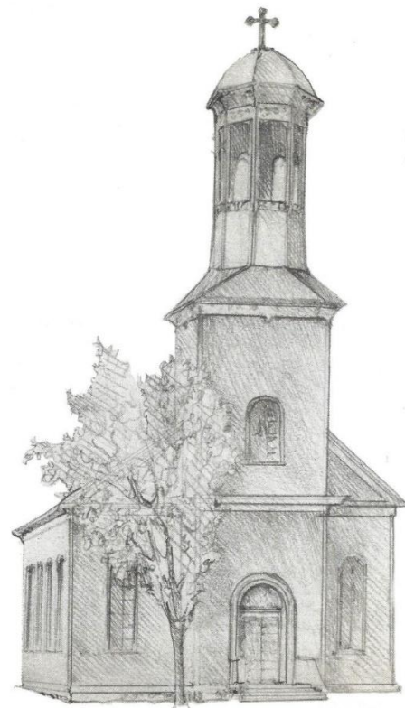
All Saints Church – Lakeville